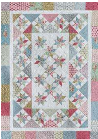
Finished Size 45" x 62"

This sweet quilt design is made using an on-point arrangement of Lemoyne Stars accented by Half- and Quarter-Square Triangle units. You'll use Deb's Rapid Fire Lemoyne Star and Tucker Trimmer 1 tools to construct this charming quilt.