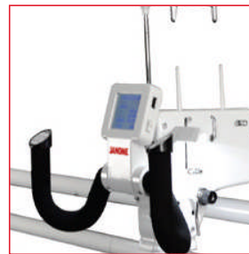
Adjustable Front and Rear Handlebars