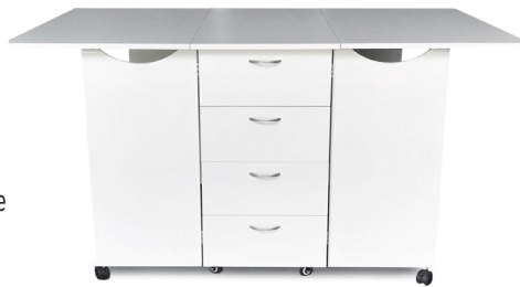
Kookaburra Cutting Table

Kangaroo sewing cabinet - check! Now complete your studio with Kangaroo storage and cutting furniture, specially designed to complement your primary workstation. With extra storage and workspace, you can customize your sewing room to be stylish, comfortable, and even more productive!