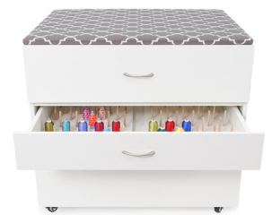
MOD Embroidery Arm Storage Cabinet

Every dream sewing oasis needs its cute, dependable accessories! Add even more convenience with MOD Embroidery Arm Storage Cabinet - featuring dedicated storage for your embroidery machine, a built-in ironing board and expansive thread drawers! Your dream sewing space won't be the same without it!