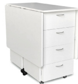
Kookaburra Cutting Table

Every dream sewing oasis needs functional, dependable accessories! Add even more convenience with a cutting table like Kookaburra , featuring two fold out leaves, four self-closing drawers, four rear removable shelves, and locking casters for easy mobility! Your dream sewing space won't be the same without it!