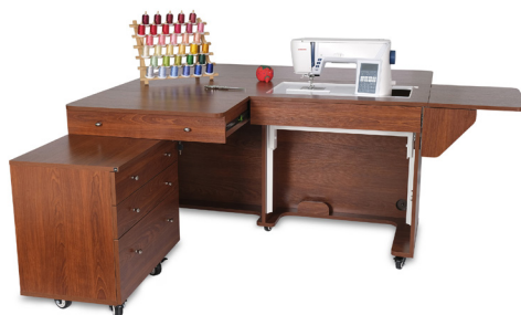
Kangaroo & Joey Sewing Cabinet

Kangaroo sewing cabinet - check! Now complete your studio with Kangaroo storage and cutting furniture, specially designed to complement your primary workstation. With extra storage and workspace, you can customize your sewing room to be stylish, comfortable, and even more productive!