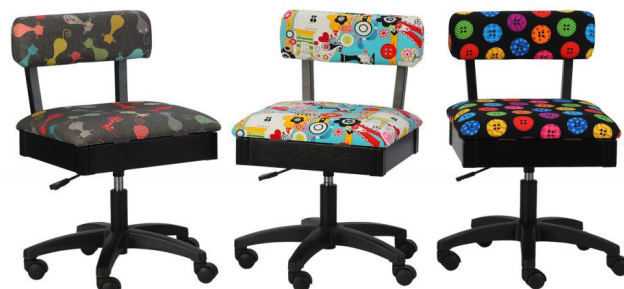
Cat's Meow, Sew Wow Sew Now & Bright Buttons Chairs

The cherry on top of your sewing sundae! Arrow's #1 Rated Height Adjustable Sewing Chair is a must have accessory for your dream sewing room! Cute, comfortable and convenient - our lovable chairs feature vibrant sewing themed patterns, 360° swivel access and lumbar support for long hours at your workstation. Don't look now, but under every seat cushion is a hidden storage compartment to store your notions and patterns! Available in 10 colors to perfectly match your sewing sanctuary!