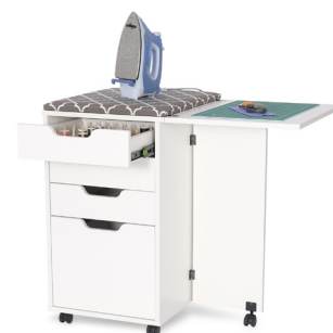
Kiwi Storage Cabinet

Every dream sewing oasis needs functional, dependable accessories! Add even more convenience with a storage cabinet like Kiwi , featuring a built-in ironing board, cutting mat, thread drawers and a dedicated drawer to store your iron! Your dream sewing space won't be the same without it!