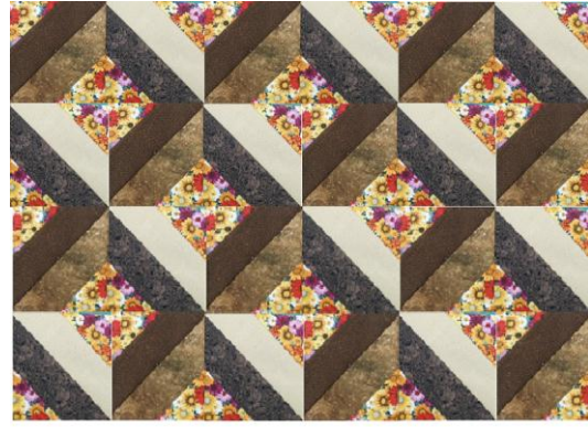
3D Lattice Windows Quilt