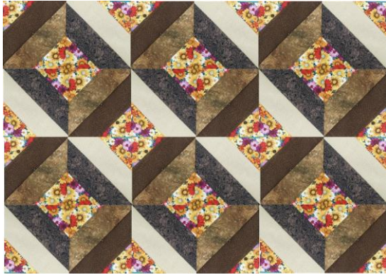
Spinning Spools Quilt

Make the Scenic Route Quilt and finish with a laser guided Pantograph design Choose your own quilt layout!